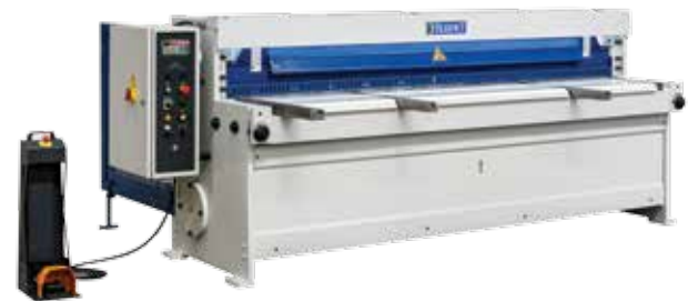
The RMS with its robust construction allows the users to get precise cuts without twists even on narrow strips