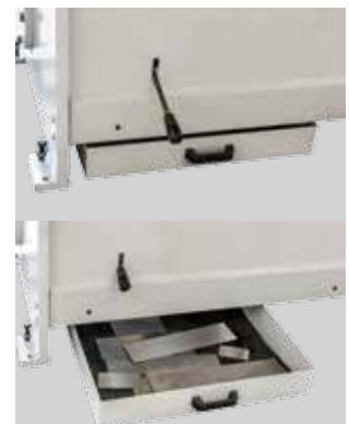
Front-side collection box to collect small parts to the front: parts up to 300mm drop into the wheel tray located in the front of the machine