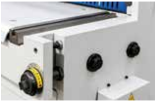
Two sided blade gap adjustment with position indicator