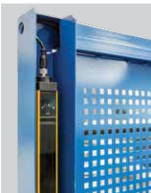
Full CE conformity protection with multi-beam light barriers and enclosures