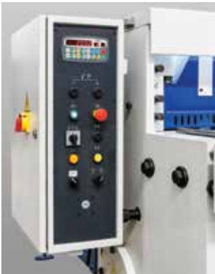
Control panel and electrical circuit in the same cabinet within easy reach