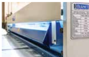
Bright LED cutting line illumination