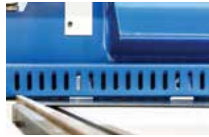
Rubber pads under hold down to avoid any markings or scratching of sheets