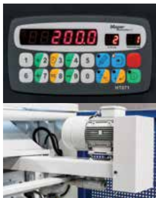
High quality programmable digital NC controller