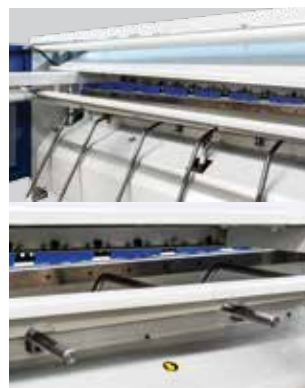
Pneumatic rear sheet support for thin sheets