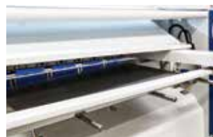
Extended holding arms keep the sheet always at the same level over the entire length