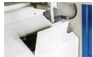
Small pieces fall into the collection box