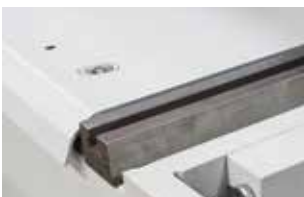
T-slot and ball transfers on table