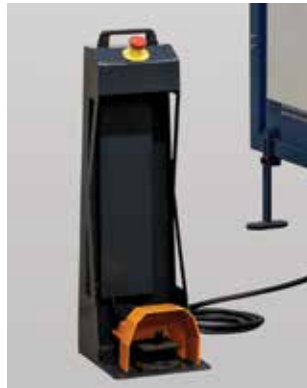
Foot pedal console with emergency stop button and hand grip