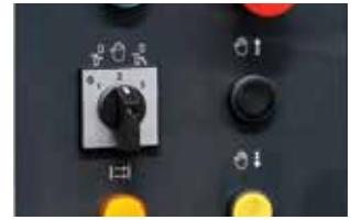
Mode switch for single / repetitive cutting or inching